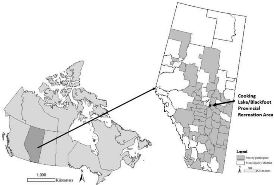
Figure 2. Study area.

to the west and prairies to the east. The northern extent of the province is dominated by boreal forest. Collectively, there are 64 counties and municipal districts that represent Alberta’s rural municipalities. Adverse human–wildlife interactions are managed jointly by the Alberta government and municipal governments, with most issues involving beavers being managed at the municipal level when outside provincial or federal-protected areas. Municipal districts are the most pertinent governance scale for the purposes of this research because they represent governments of rural areas often referred to as “counties” (Alberta Municipal Affairs [AMA], 2016); however, four larger cities and four provincial parks districts also participated. For our study, the combined municipal districts, cities, and park districts are referred to as “municipalities.”